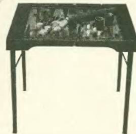
BACKGAMMON TABLE—of American walnut with ebonized wood sides. Cork field with red and black points. Size of top 34" x 25". Table 28" high. Complete with set of 134" boxwood draughts, two cowhide dice cups, felt lined, and four dice. $75